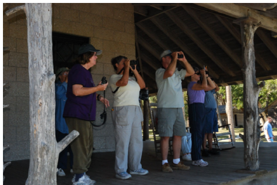
The group birding from the porch of the Princess Place home.

On the Island Trail, walkable at low tide, we heard and saw a Marsh Wren. On the Blue Trail we added Carolina Chickadee, Blue-headed Vireo, Yellow-bellied Sapsucker, and Yellow-throated, Pine, Palm and Black-and-white Warblers. Also sighted from the park were Peregrine Falcon, Red-tailed Hawk, American Eagle and White Pelican. We covered only a small portion of the park and saw 48 species.